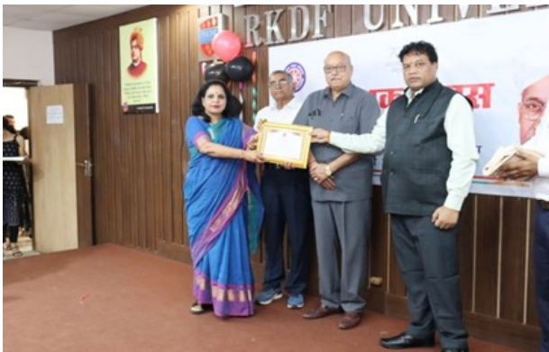
Best Teacher Award