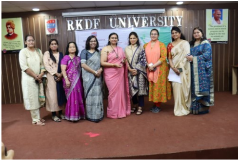
International Women's Day Celebrations