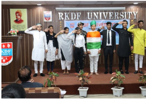
Skit on Unity in Diversity