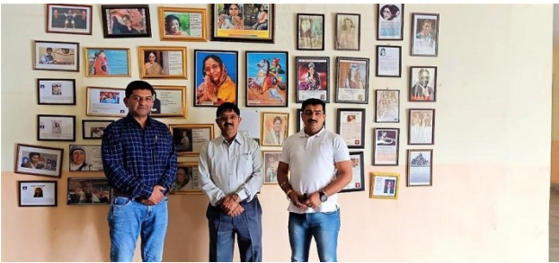
District Judge Visit