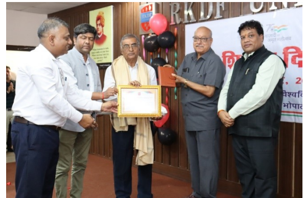
Award for Research & Development