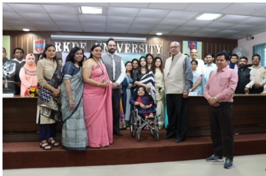
International Women's Day Celebrations