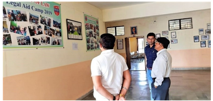
District Judge Visit