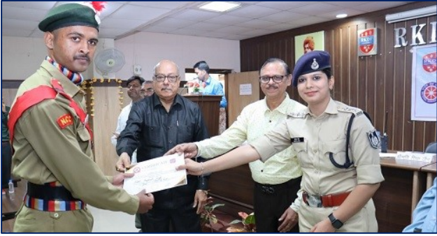
National Unity Day