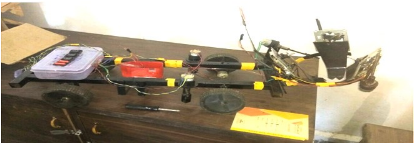
Plant Shifting Robot