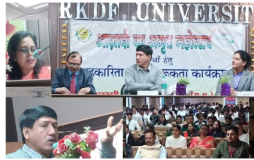
Sahakarita par Jagrukta