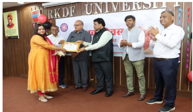
Best Teacher Award