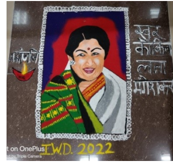
International Women's Day Celebrations