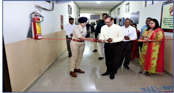
National Unity Day