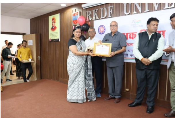
Best Teacher Award