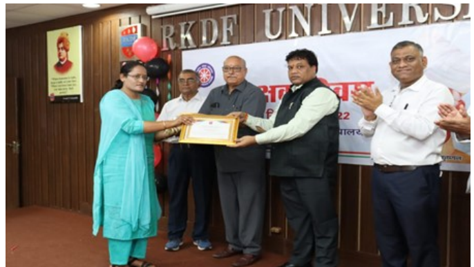
Best Teacher Award